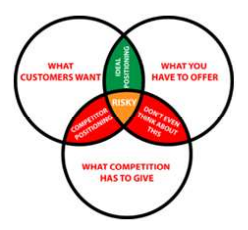
Types of Positioning

A positioning strategy depends on many factors which include current market conditions, your product, USP of your product, competitors, their products and the USPs of their products. Marketers plan of how they want their product to be seen by the customers in future also plays a vital role in deciding which type of positioning strategy to choose.