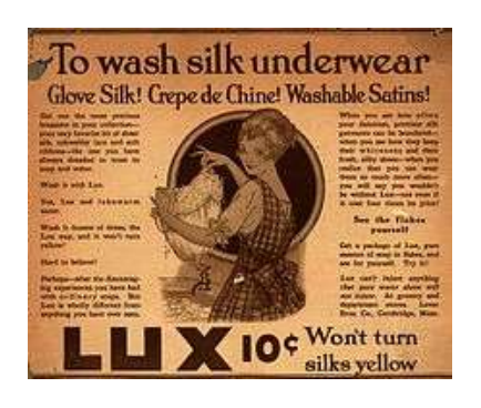
Lux, print advertisement, 1916, Lux was 'positioned' as the soap for all fine fabrics