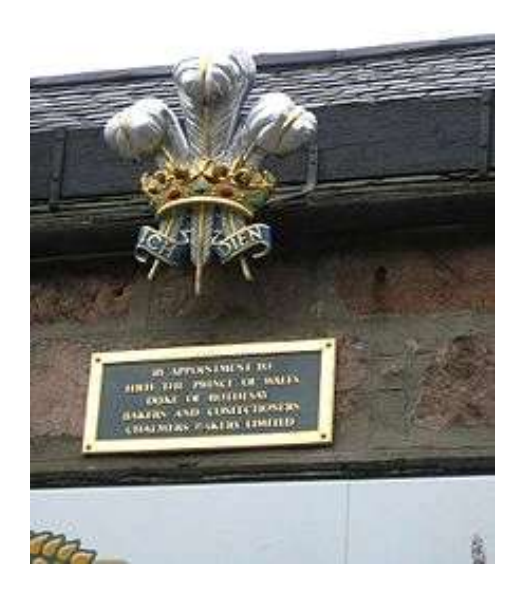
By the 18th century, manufacturers began displaying a royal warrant on their premises and on their packaging

The granting a royal charter to tradesmen, markets and fairs was practiced across Europe from the early Medieval period. At a time when concerns about product quality were a major public issues, a royal endorsement provided the public with a signal that the holder supplied goods worthy of use in the Royal household, and by implication inspired public confidence. In the 15th century, a Royal warrant of appointment replaced the royal charter in England. The Lord Chamberlain of England formally appointed tradespeople as suppliers to the Royal household. The printer, William Caxton, for example, was one of the earliest recipients of a Royal Warrant when he became the King's printer in 1476. By the 18th-century, mass market manufacturers such as Josiah Wedgewood and Matthew Boulton, recognised the value of supplying royalty, often at prices well below cost, for the sake of the publicity and cudos it generated. Many manufacturers began actively displaying the royal arms on their premises, packaging and labelling. By 1840, the rules surrounding the display of royal arms were tightened to prevent fraudulent claims. By the early 19th century, the number of Royal Warrants granted rose rapidly when Queen Victoria granted some 2,000 royal warrants during her reign of 64 years.