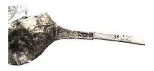
Hallmark on an English silver spoon, dated to the Medieval period