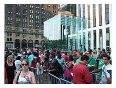
Line of people waiting for the iPhone 3G outside of the Apple Storein New York City, 2008.