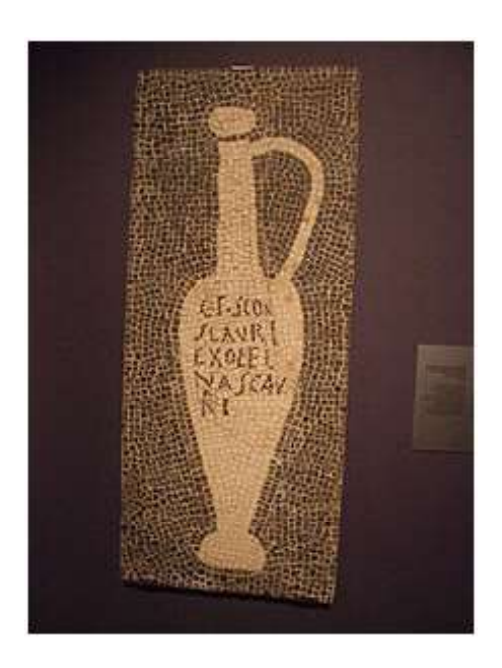
Mosaic showing garum container, from the house of UmbriciusScaurus of Pompeii. The inscription which reads "The flower of garum, made of the mackerel, a product of Scaurus, from the shop of Scaurus"

(also known as garum) was branding his amphora which travelled across the entire Mediterranean. Mosaic patterns in the atrium of his house were decorated with images of amphora bearing his personal brand and quality claims. The mosaic comprises four different amphora, one at each corner of the atrium.